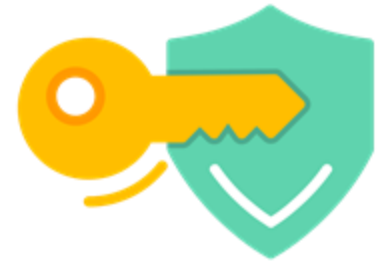
Open Data Democratization