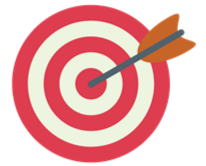
Essential Tools to impact