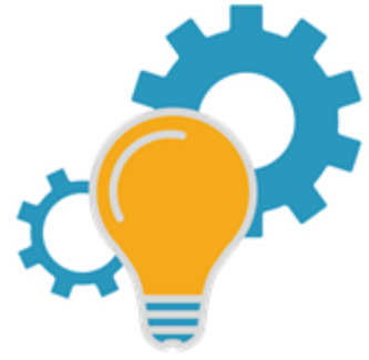
Encourage collaboration and innovation