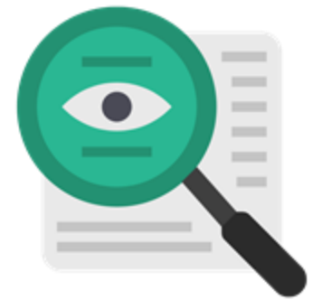
Transparency and accountability