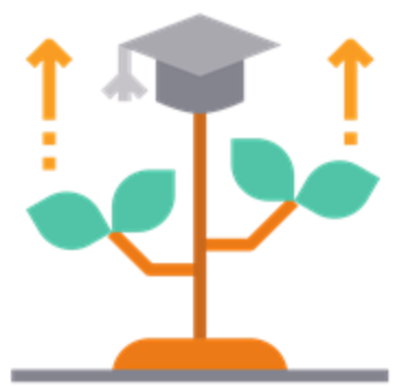
Education and Youth